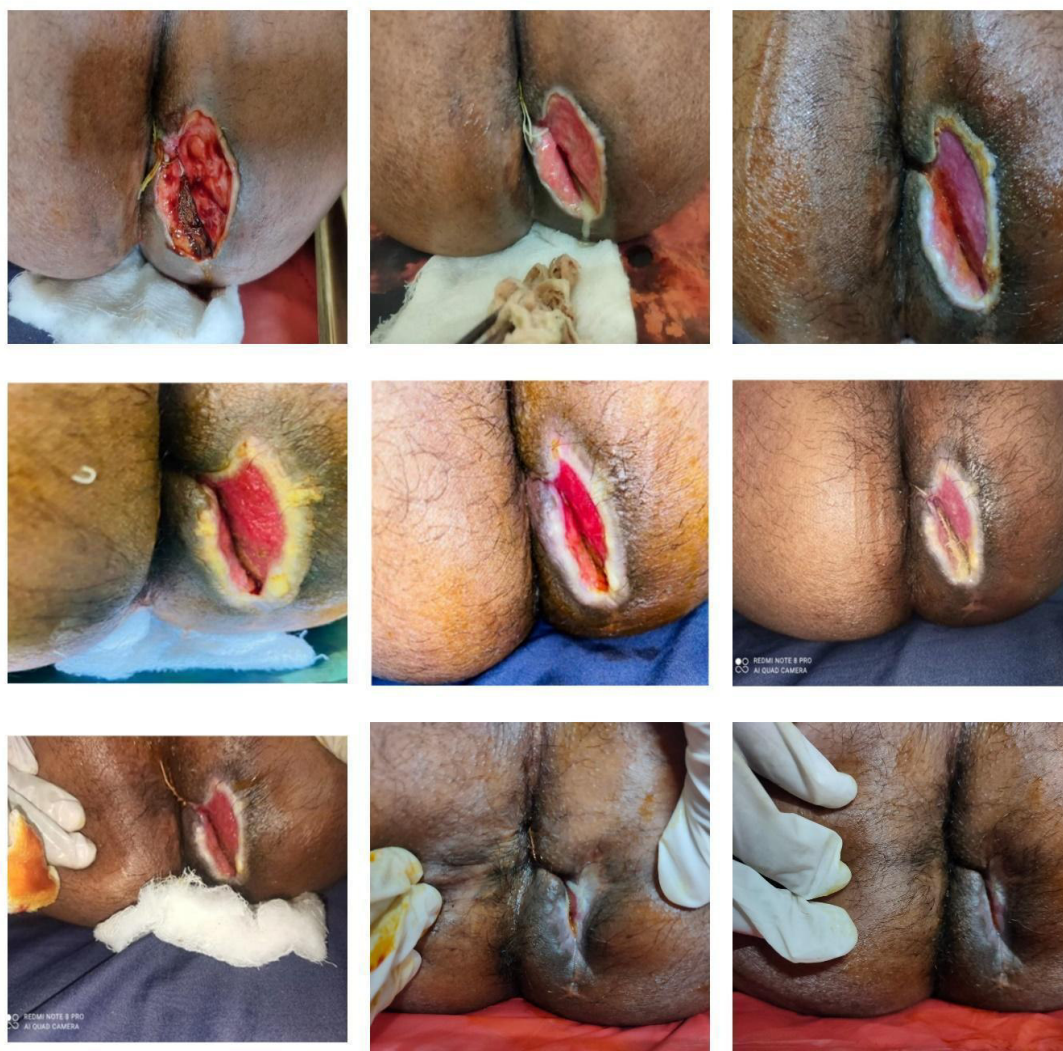
Fig 5 contains 9 pictures of the post-operative care from 11/5/2022 to 27/7/2022. In this wound, size was observed with cutting and healing of the fistular track with thread. In the recent few days, pus was discharged from the abscess cavity, which was washed with Betadine+ Hydrogen peroxide +Normal saline. Then Kshara taila was poured into the cavity, and outer packing in the wound was given by Panchavalka ointment. On every 7 th day, Ksheersutra was changed. Every week, there was an improvement in the granulation of the wound with a decrease in wound size and healing.