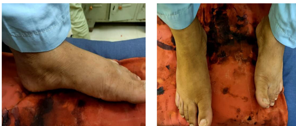
Fig 3: Mild Pedal edema was present.