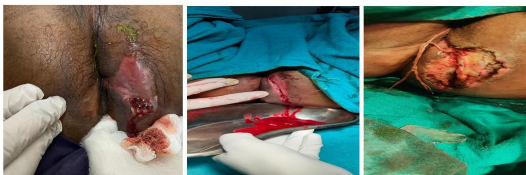
Fig 2: In the first picture, there is a burst boil with bloody discharge; in the 2 nd picture, Incision and drainage are done; in the 3 rd picture, after Incision and drainage, the fibrosis skin was debrided, probing was done and Ksheer sutra ligation is done.

Incision deepened, pus pockets drained, loculi broken by using fingers. Pus collected for culture and sensitivity. Probing was done from the 3'0'clock position, and the internal opening was located at 5 to 6 0 clock position in the anal canal above the dentate line. Ksheerasutra ligation was done. Surrounding fibrosed tissues, the abscess cavity was debrided, and the sample was sent to an osteopath. The cavity was cleaned with Betadine +H 2 O 2 + NS; Complete hemostasis was achieved. Packing of the abscess cavity was done with Betadine gauze and bandaging. The patient was shifted to the ward in normal condition. The procedure could have been more uneventful.