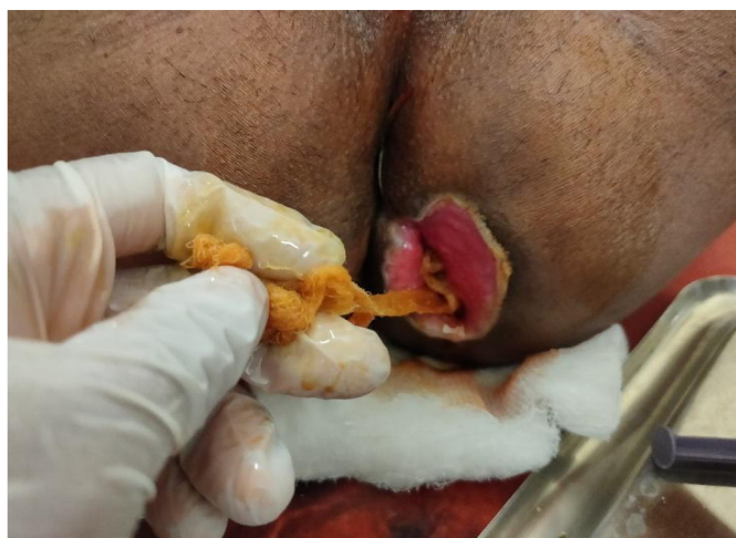
Fig 4-Kshara Taila Pooran by Gauze